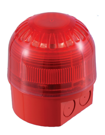
Applications - Safety; industrial alarm